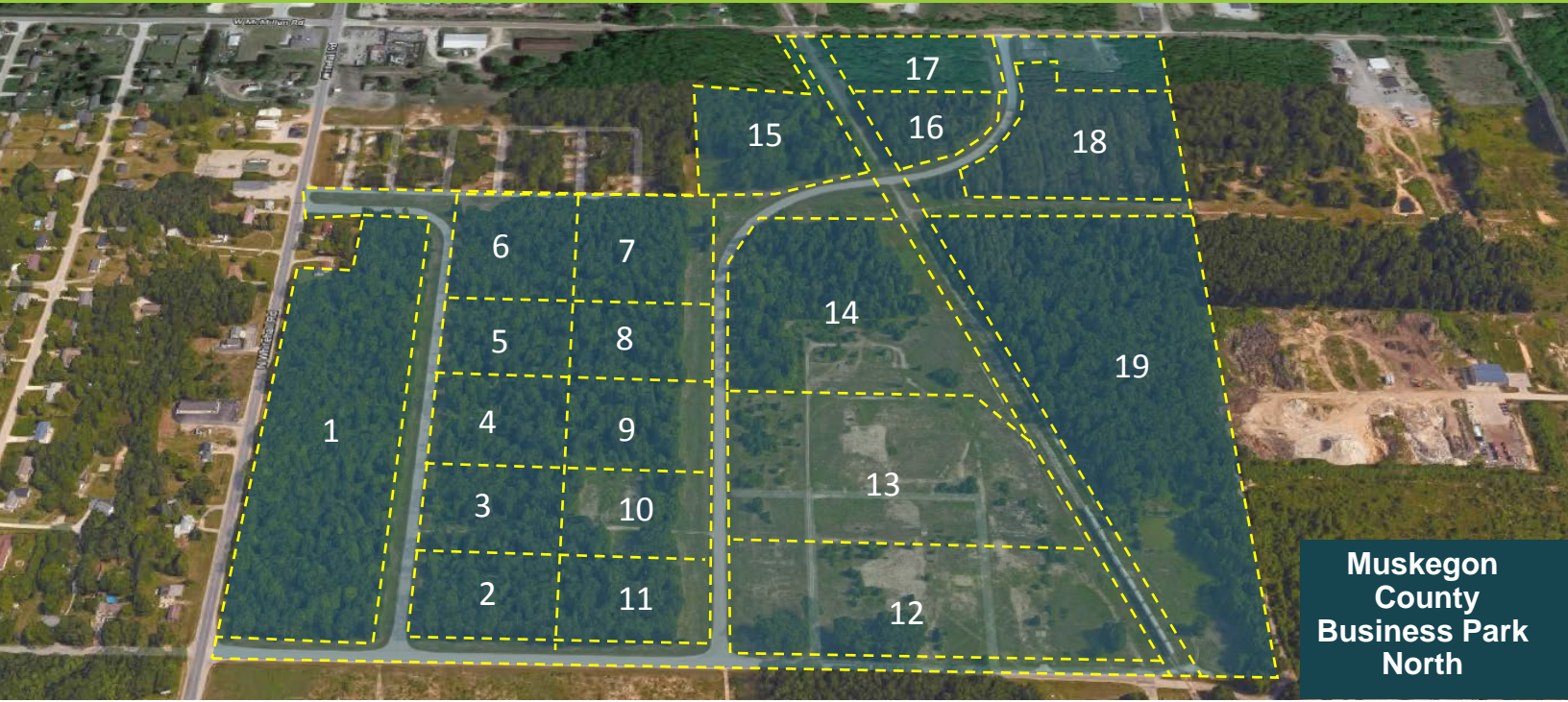
Muskegon County Business Park North