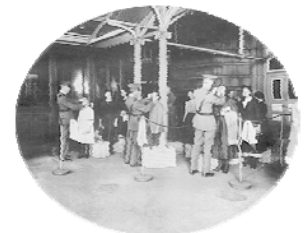
Immigrants coming into the United States were given a health inspection by Public Health Service physicians (c. 1910).