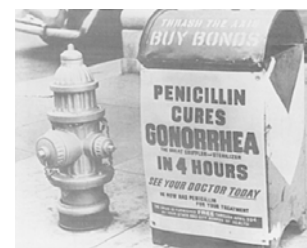
This WWII ad informs soldiers about a new drug that cures gonorrhea. (c.1944)

During the 1940s several public health advancements were made, such as the creation of mobile x-ray units, production and distribution of blood products, fluoridation of water supplies, and testing for hearing and vision impairments. Again during wartime, emphasis was placed on reducing venereal diseases such as syphilis and gonorrhea.