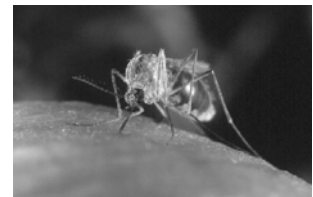
West Nile virus is transmitted by mosquitoes. It sickened 504 and killed 41 Michigan residents in 2002.