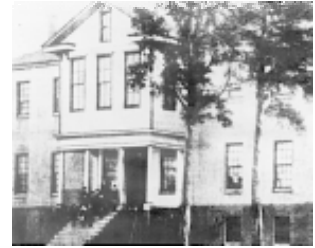
The first Marine Hospitals were in port cities along the East Coast. As trade routes expanded inland towards the Great Lakes, so did the Marine Hospitals. (c. 1860)

The Marine Hospital Service inherited this new task of controlling epidemic diseases through quarantine, disinfection measures, and immunization programs throughout the nation. Because of the broadening responsibilities, its name was changed to the Public Health and Marine Hospital Service and again to just the Public Health Service.