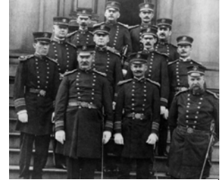
Public Health Service Officers (c. 1912)

Another major effort began in 1878 as the State Board of Health began organizing city, village, and township boards of health with active health officers in an effort to make a larger impact on sanitary conditions in the state. The City of Muskegon was the first in the county to pass a local ordinance on December 15, 1879 to establish a City Board of Health.