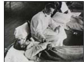
As sailors and soldiers fell ill, doctors puzzled over the mystery illness they were confronting.

During World War I, the concept that healthy soldiers were necessary for a strong national defense was revisited. A high rate of prospective servicemen were found to be unfit for performing military duty because of syphilis infection. Therefore, in 1917 the State Board of Health began testing men for free. Also in 1917, a law was passed authorizing the formation of health districts composed of townships and villages.